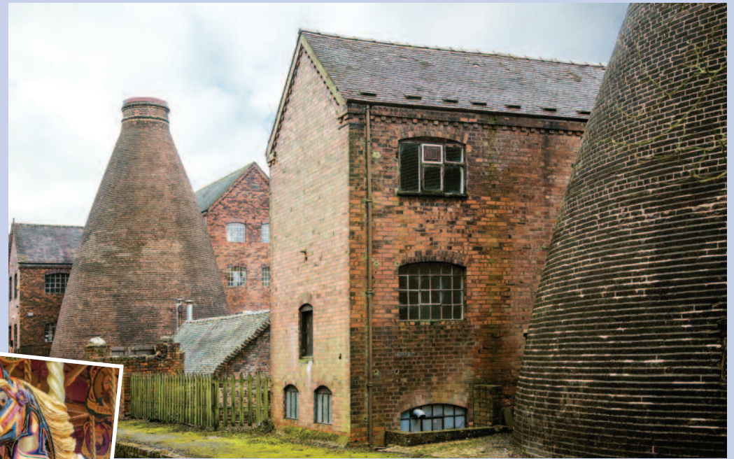
Above: The canal-side Coalport China factory — now the Coalport China Museum.